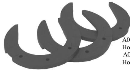
A0032-1P -- Optional 25# Horseshoe Weights (each) A0032-3p -- Optional 36# Horseshoe Weights (each)