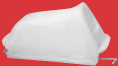
4 Gallon Tank (Available in Eight (8) Different Colors)